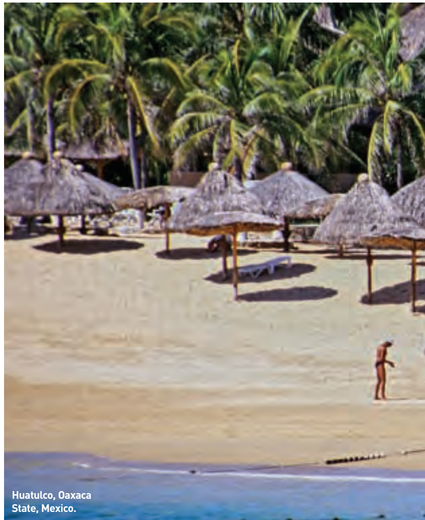
Huatulco, Oaxaca State, Mexico.