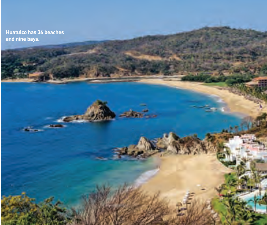
Huatulco has 36 beaches and nine bays.

phases. But savvy investors are snapping up properties now. Today's prices, which are half or less of what you'd pay in resorts like Los Cabos, won't last.